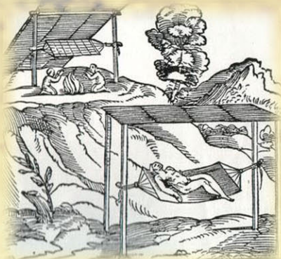
Taínos sleeping in cotton hammocks

Taínos lived in organised societies headed by a cacique. He was responsible for making and enforcing laws, settling disputes, land distribution, organization of labour, planting and distribution of crops, and leading religious ceremonies.