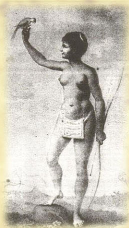
Taíno woman wearing cotton loincloth

Taínos lived in organised societies headed by a cacique. He was responsible for making and enforcing laws, settling disputes, land distribution, organization of labour, planting and distribution of crops, and leading religious ceremonies.