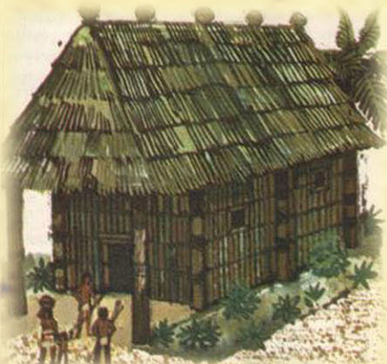
Caney - the cacique's house

Except for married women, the Taínos, wore little or no clothing. However, on ceremonial occasions they wore accessories made from shell, bone, wood and stone, and elaborate headresses made from feathers.