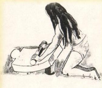
Preparation of casabe (bamy)